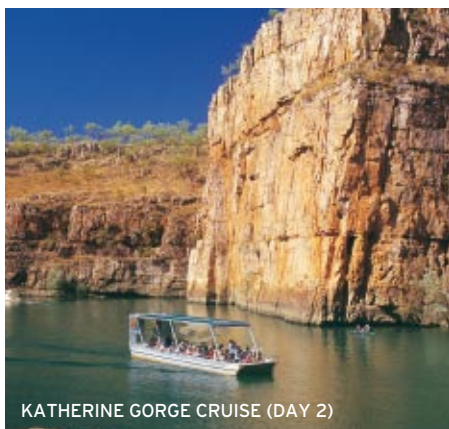
KATHERINE GORGE CRUISE (DAY 2)