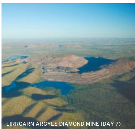
LIRRGARN ARGYLE DIAMOND MINE (DAY 7)