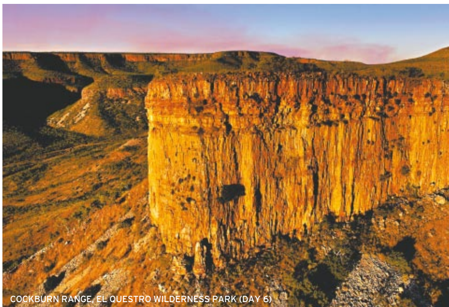
COCKBURN RANGE, EL QUESTRO WILDERNESS PARK (DAY 6)