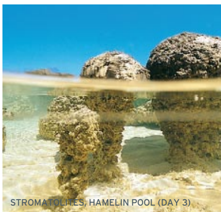
STROMATOLITES, HAMELIN POOL (DAY 3)