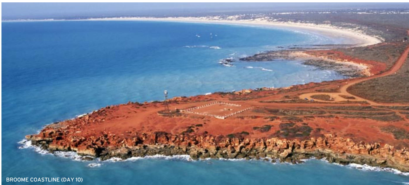
BROOME COASTLINE (DAY 10)