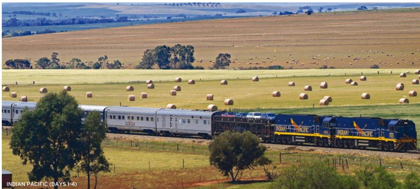
INDIAN PACIFIC (DAYS 1-4)