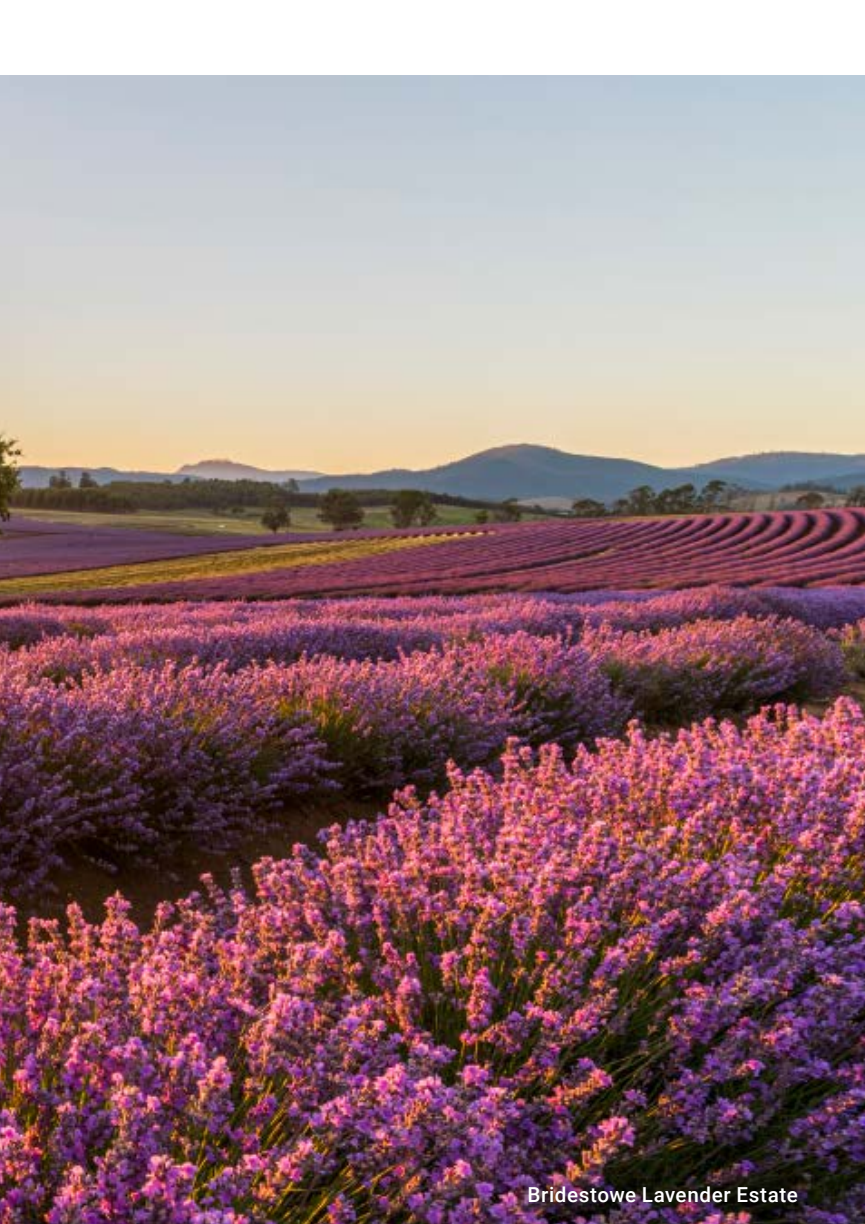
Bridestowe Lavender Estate