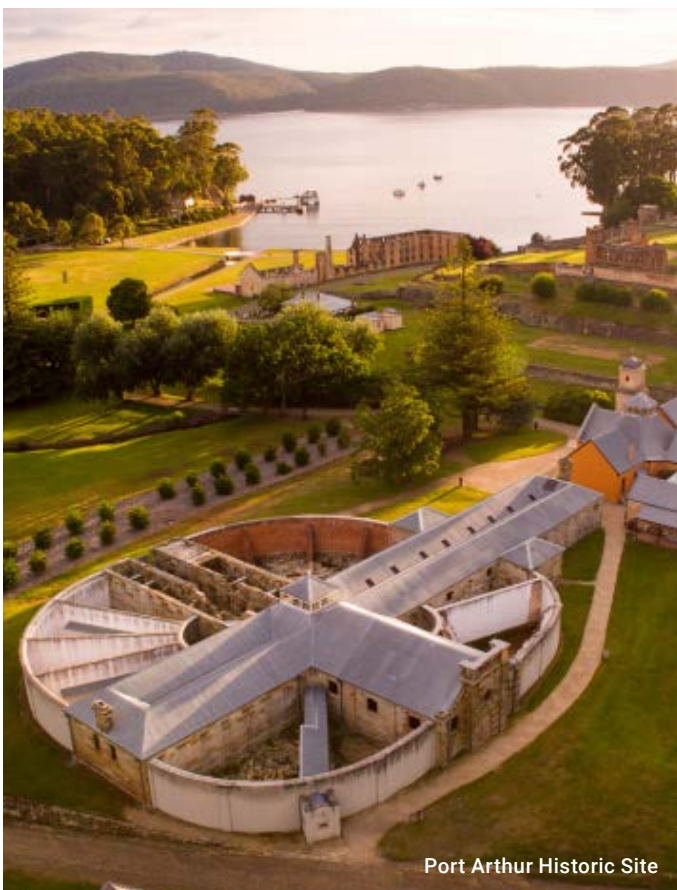
Port Arthur Historic Site

Start & end your tour in Hobart. See Tasmanian Wonders page 74.